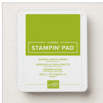
Granny Apple Green