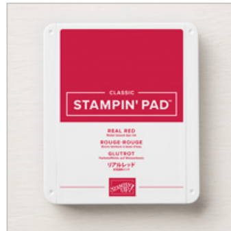
Real Red Classic