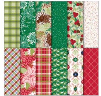
Under The Mistletoe Designer Series