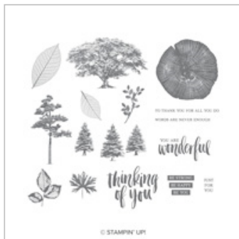
Rooted In Nature Wood-Mount Stamp Set