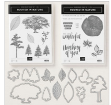
Rooted In Nature Wood-Mount Bundle