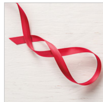
Real Red 3/8" (1 Cm) Mixed Satin Ribbon