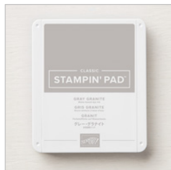
Gray Granite Classic Stampin' Pad