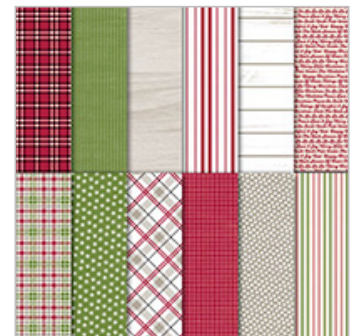
Festive Farmhouse 12" X 12" (30.5 X 30.5 Cm) Designer Series Paper