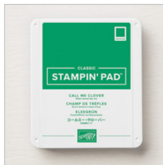
Call Me Clover Classic Stampin' Pad