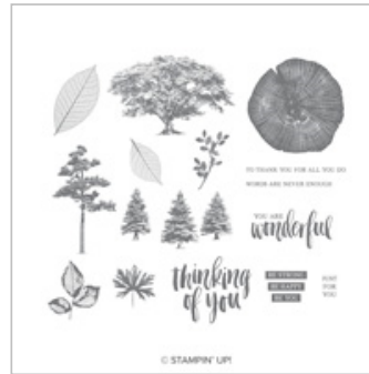
Rooted In Nature Clear-Mount Stamp Set