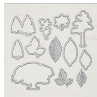
Nature's Roots Framelits Dies