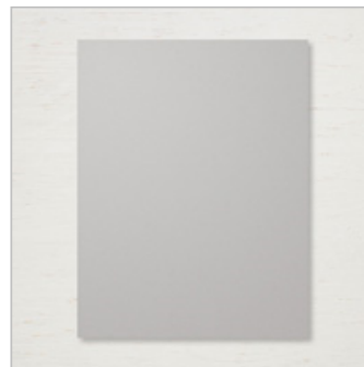
Gray Granite 8-1/2" X 11" Cardstock