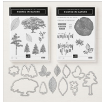
Rooted In Nature Clear-Mount Bundle