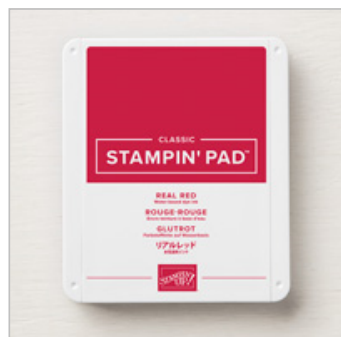
Real Red Classic Stampin' Pad