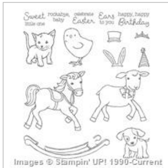
Little Cuties Photopolymer Stamp