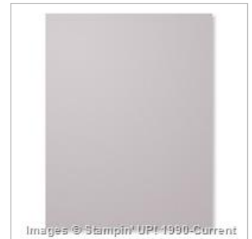
Smoky Slate 8-1/2" X 11" Cardstock