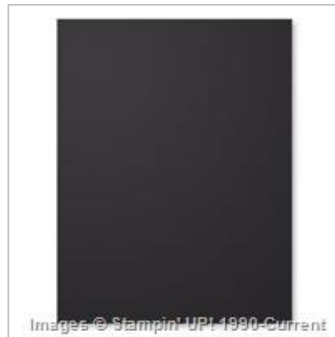
Basic Black 8-1/2" X 11" Cardstock