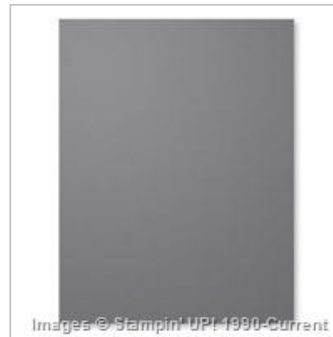
Basic Gray 8-1/2" X 11" Cardstock