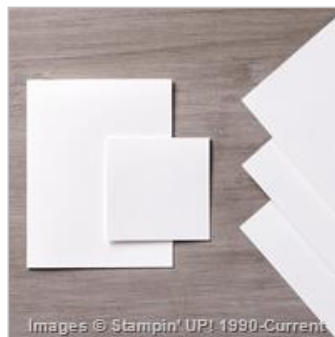
Whisper White 8-1/2" X 11" Thick Cardstock