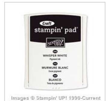
Whisper White Craft Stampin' Pad