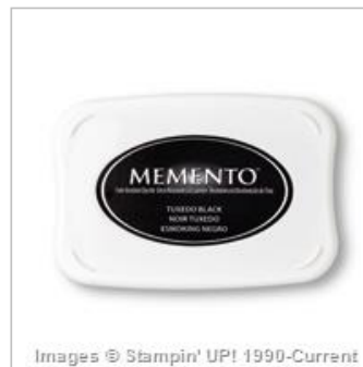
Tuxedo Black Memento Ink Pad