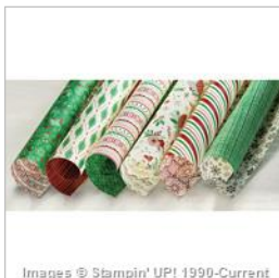
This Christmas Designer Series Specialty Paper - 141628