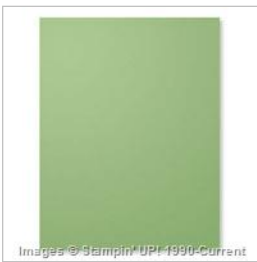
Wild Wasabi 8-1/2" X 11" Cardstock - 108641