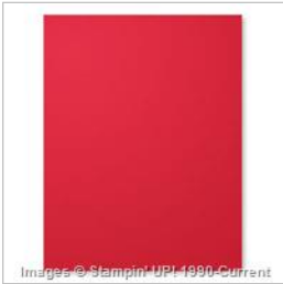
Real Red 8-1/2" X 11" Cardstock - 102482