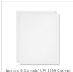
Vellum 8-1/2" X 11" Cardstock - 101856