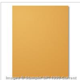
Delightful Dijon 8-1/2" X 11" Cardstock - 138338