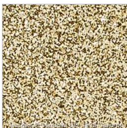
Gold Glimmer Paper - 133719