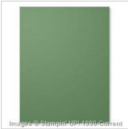
Garden Green 8-1/2" X 11" Cardstock - 102584