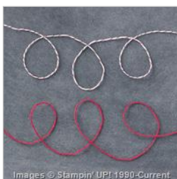
Candy Cane Lane Baker's Twine - 141983