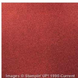
Red Glimmer Paper - 121790