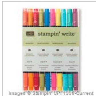
Brights Stampin' Write Markers