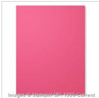
Melon Mambo 8-1/2" X 11" Cardstock