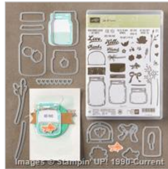
Jar Of Love Photopolymer Bundle