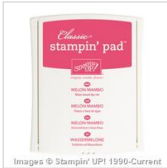
Melon Mambo Classic Stampin' Pad