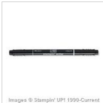
Basic Black Stampin' Write Marker