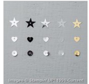
Metallics Sequin Assortment