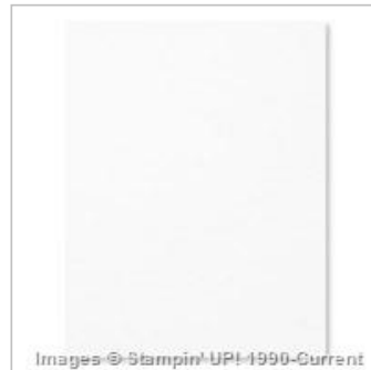
Whisper White 8-1/2" X 11" Cardstock