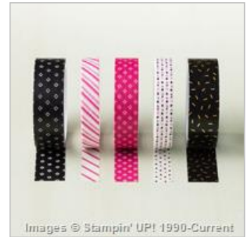
Pop Of Pink Designer Washi Tape