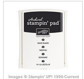
Basic Black Archival Stampin' Pad