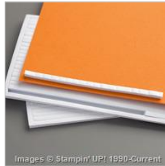
Foam Adhesive Strips