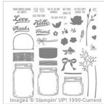
Jar Of Love Photopolymer Stamp