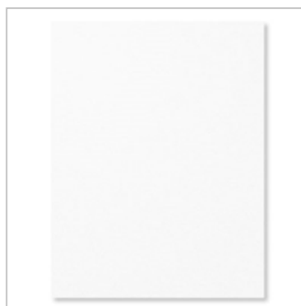
Whisper White 8-1/2" X 11" Cardstock