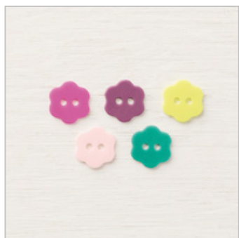
2017-2019 In Color Flower Buttons