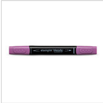
Rich Razzleberry Dark Stampin' Blends