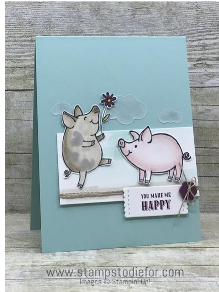
Card CASE from pg. 33 in the Annual Catalog