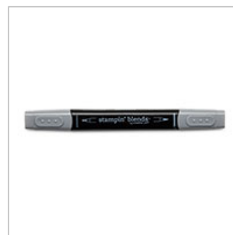
Smoky Slate Dark Stampin' Blends Marker