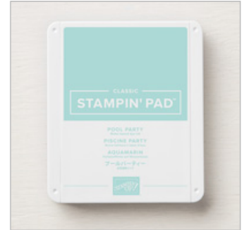
Pool Party Classic Stampin' Pad