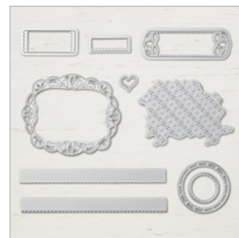
Stitched Labels Framelits Dies