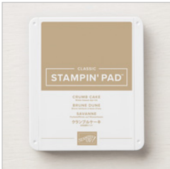
Crumb Cake Classic Stampin' Pad