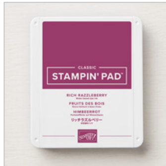
Rich Razzleberry Classic Stampin' Pad