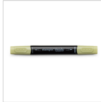
Old Olive Light Stampin' Blends