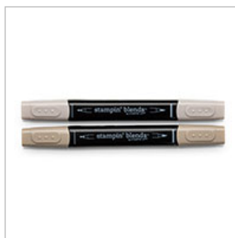
Crumb Cake Stampin' Blends Markers Combo Pack