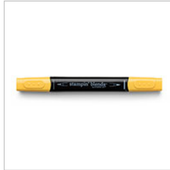
Daffodil Delight Dark Stampin' Blends