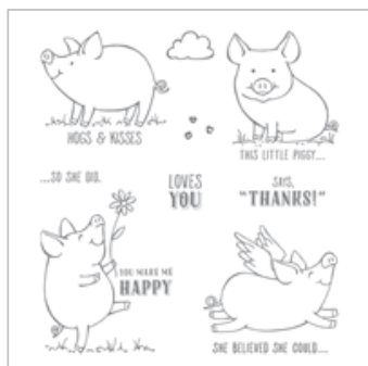
This Little Piggy Clear-Mount Stamp