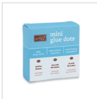
Mini Glue Dots