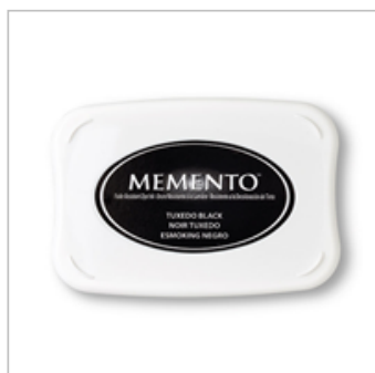
Tuxedo Black Memento Ink Pad