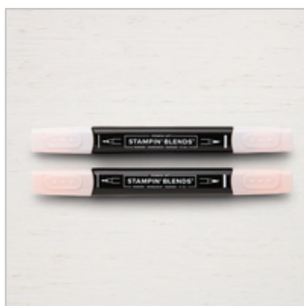
Petal Pink Stampin' Blends Markers Combo Pack