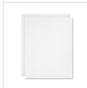
Vellum 8-1/2" X 11" Cardstock