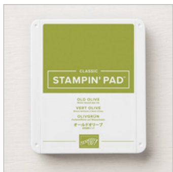
Old Olive Classic Stampin' Pad