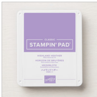
Highland Heather Classic Stampin' Pad