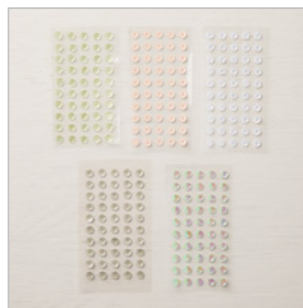
Basic Adhesive-Backed Sequins