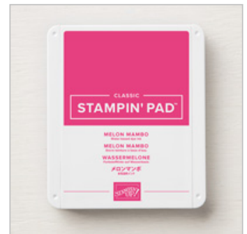
Melon Mambo Classic Stampin' Pad