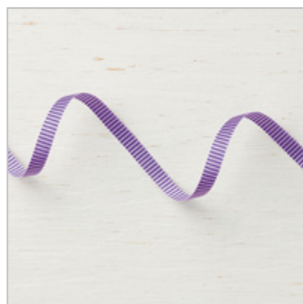
Gorgeous Grape 1/4\" (6.4 Mm) Mini Striped Ribbon