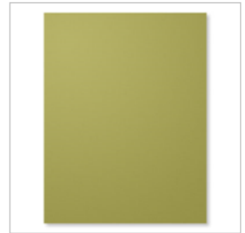
Old Olive 8-1/2" X 11" Cardstock