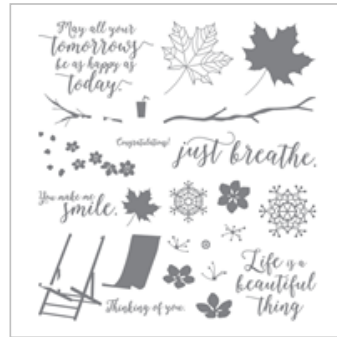
Colorful Seasons Photopolymer Stamp Set