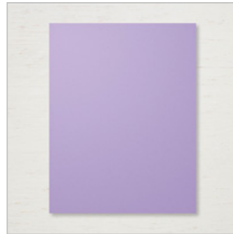
Highland Heather 8-1/2" X 11" Cardstock