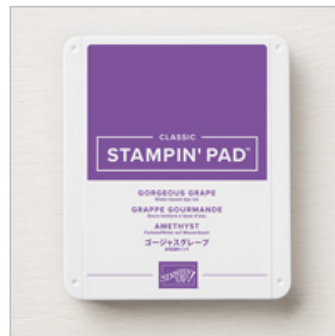
Gorgeous Grape Classic Stampin' Pad